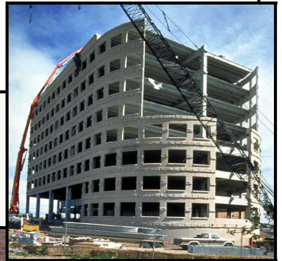
Total Precast Office Building Office Building at 198 Inverness Drive West, Englewood, Colo. POUW & Associates, Inc.